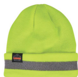
16864 — Lime