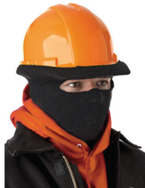
6815 Full Face