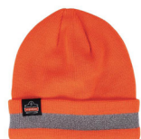
16865 — Orange