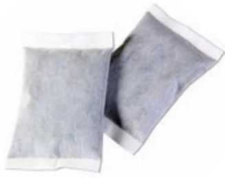
6990 — Hand Warming Packs