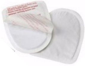
6992 — Toe Warming Packs

To activate, simply open the wrapper and expose the warming pack to the air, providing comfortable heat lasting— up to 7 hours for the toe warming pack (6992) and up to 12 hours for the hand warming pack (6990). The easy to dispose packs contain no toxic materials and are sold 40 pairs per case.