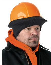
6810 Half Face