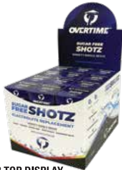
COUNTER TOP DISPLAY ITEM ID # OT-10VAR24CT 24 TEN PACKS PER DISPLAY