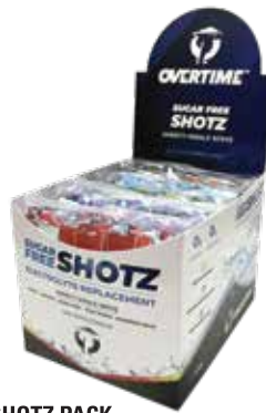
VARIETY SHOTZ PACK ITEM ID # OT-10VAR320CT 5 PACKS PER DISPLAY (32 SHOTZ PER PACK)