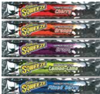
ZERO - Sugar Free Formulation - (159200231)