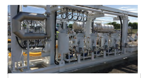
Truck Unload Skid