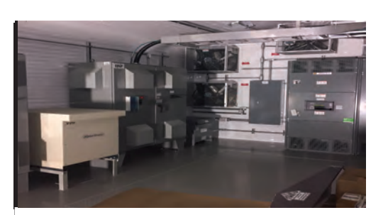
Plug & Play MCC Room